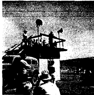
PHOTOGRAPH of speakers platform at Geo. Van Tassel's Giant Rock Spacecraft convention. Truman Bethurum is speaking, while Orfeo Angelucci is standing in background. Note portion of circular cloud at left of picture (although we are not sure it will be visible in this reproduction).